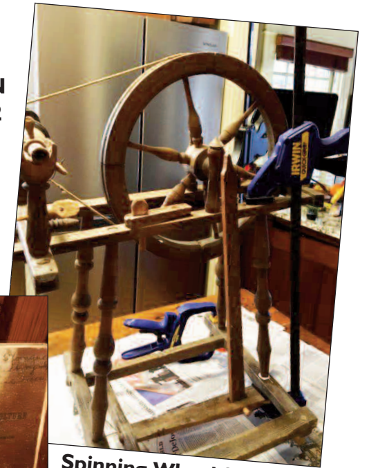
Spinning Wheel from the PLANK/DALUGE FAMILY