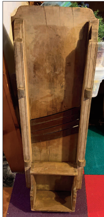
The 100+ year old cabbage shredder is in our kitchen display at the Museum in City Hall.

The land they had included the lake that's somewhere near that road and a lot of acreage was lost. It was apparently important because there is a Kurtz Lane on Hwy. 4 south of 62 Crosstown.