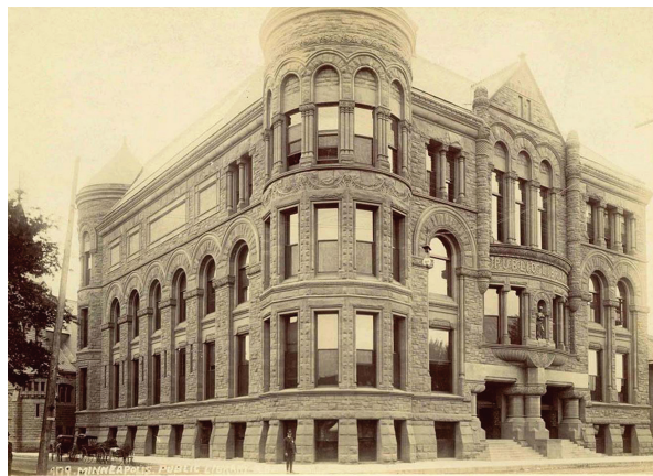
The first central library of the Minneapolis Public Library (also known as the main library) was built in 1889 along Tenth Street and Hennepin Avenue about six blocks south of the current building. The building was demolished 1961.

Since January 1, 2008 the urban Minneapolis Public Library has been part of the suburban Hennepin County Library system.